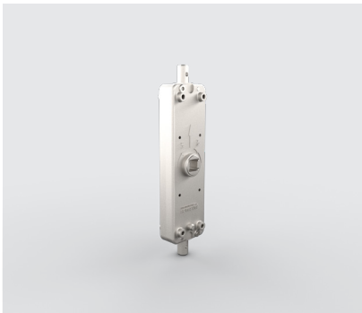
6337-020010 Gear unit, with 10 mm square hole