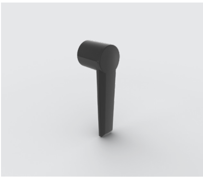
Mechanic, with handle, with 10mm square bar insert