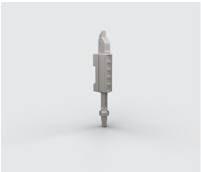
6337-020050 Latch unit